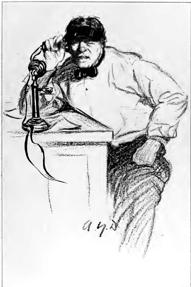
A round headed man in his shirtsleeves comes into view.